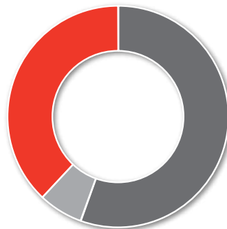
4 Terminal Lines